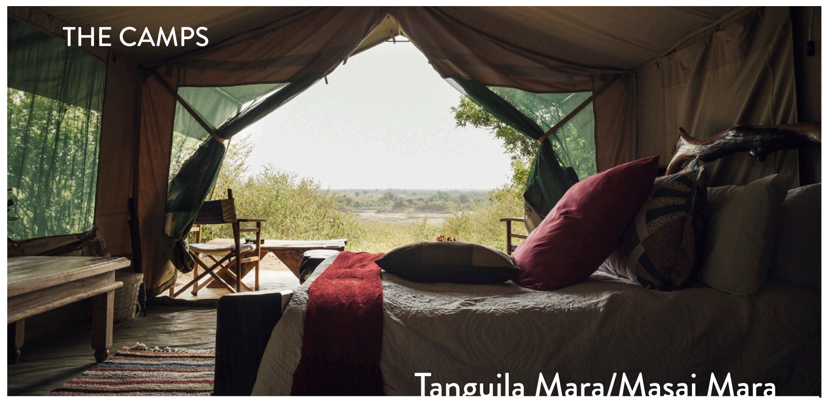
Tanguila Mara/Masai Mara