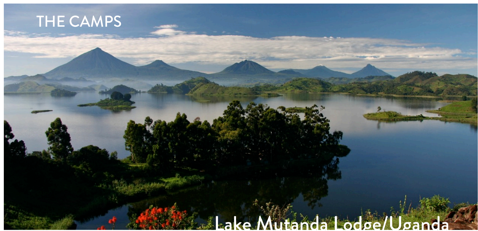
Lake Mutanda Lodge/Uganda